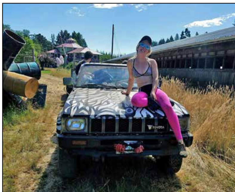
Tanager takes a break atop Wally the zebra truck at the Fair.