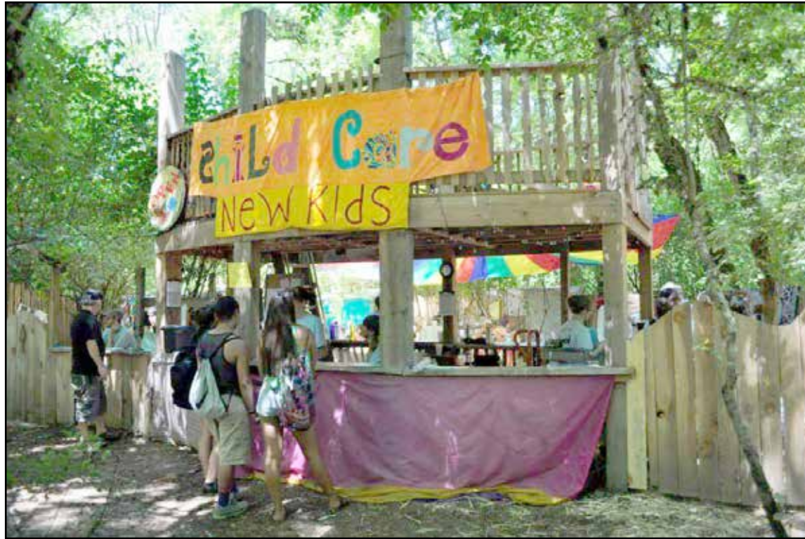
New Kids Child Care on Wally's Way

In addition to our two main locations, we have offered several attractions on Wally's Way, including a natural science exhibit, art installations,