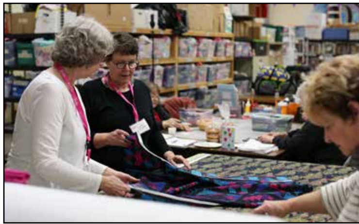
Volunteers get ready to sew bags, such as those below.

For the past 11 years, Bags of Love has provided support to children suffering from the damaging effects of abuse, neglect, poverty, and homelessness. Last year, more than 2,200 Lane County children and teens received a “bag of love” filled with clothing, outerwear, toiletries, school supplies, toys, and the handmade quilt or fleece blanket that is the signature of every bag we distribute. Our bags fulfill physical needs and provide basic necessities, but they also do much more than that — they offer comfort, security, and hope to children when they are at their most vulnerable. We work with 54 regional nonprofits, school districts, and government offices, such as CAHOOTS, Centro Latino Americano, Head Start of Lane County, and the Department of Human Services, to distribute bags to the children they serve, at no