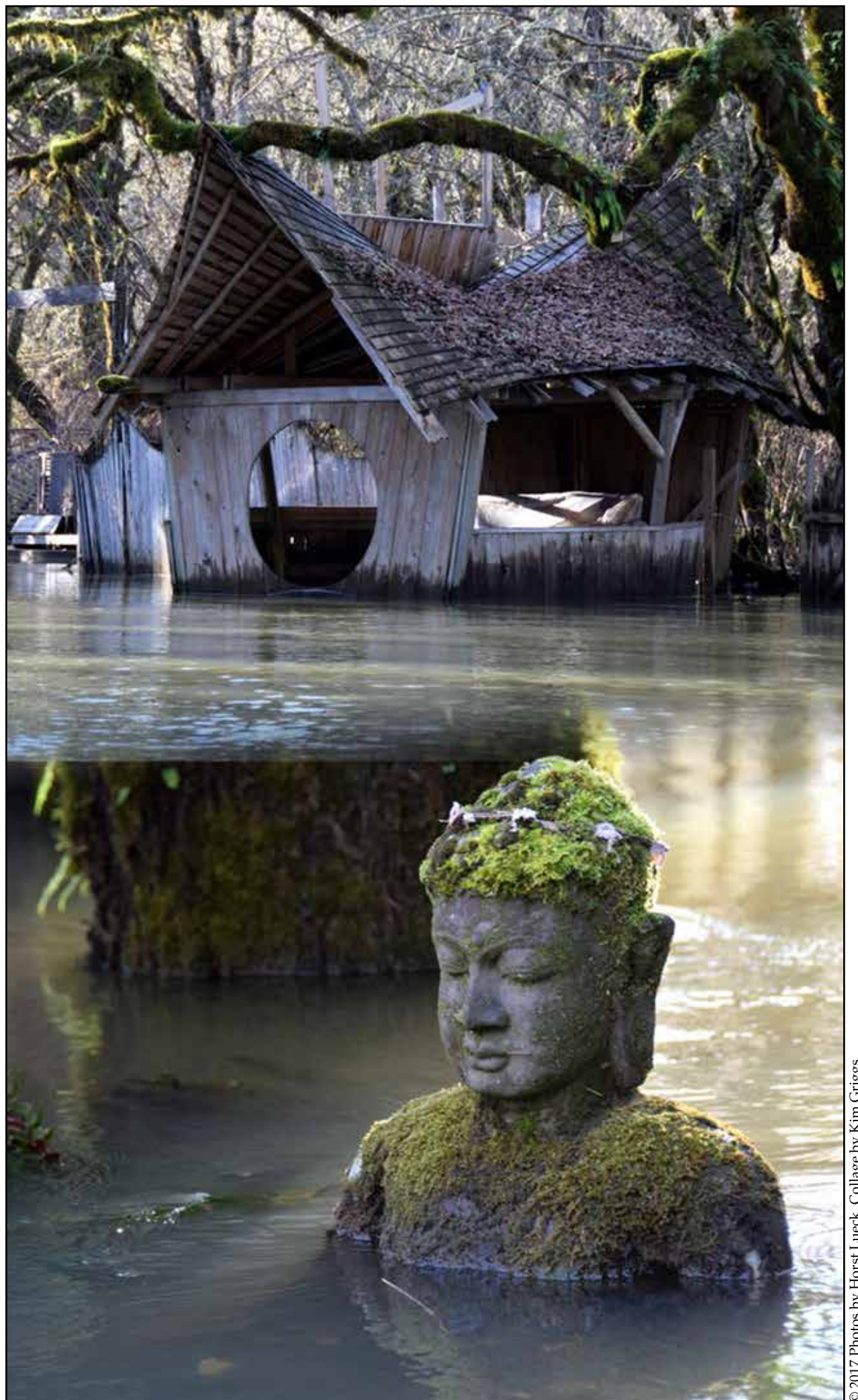
© 2017 Photos by Horst Lueck. Collage by Kim Griggs

Take a deep breath. Underwater Fair Land.