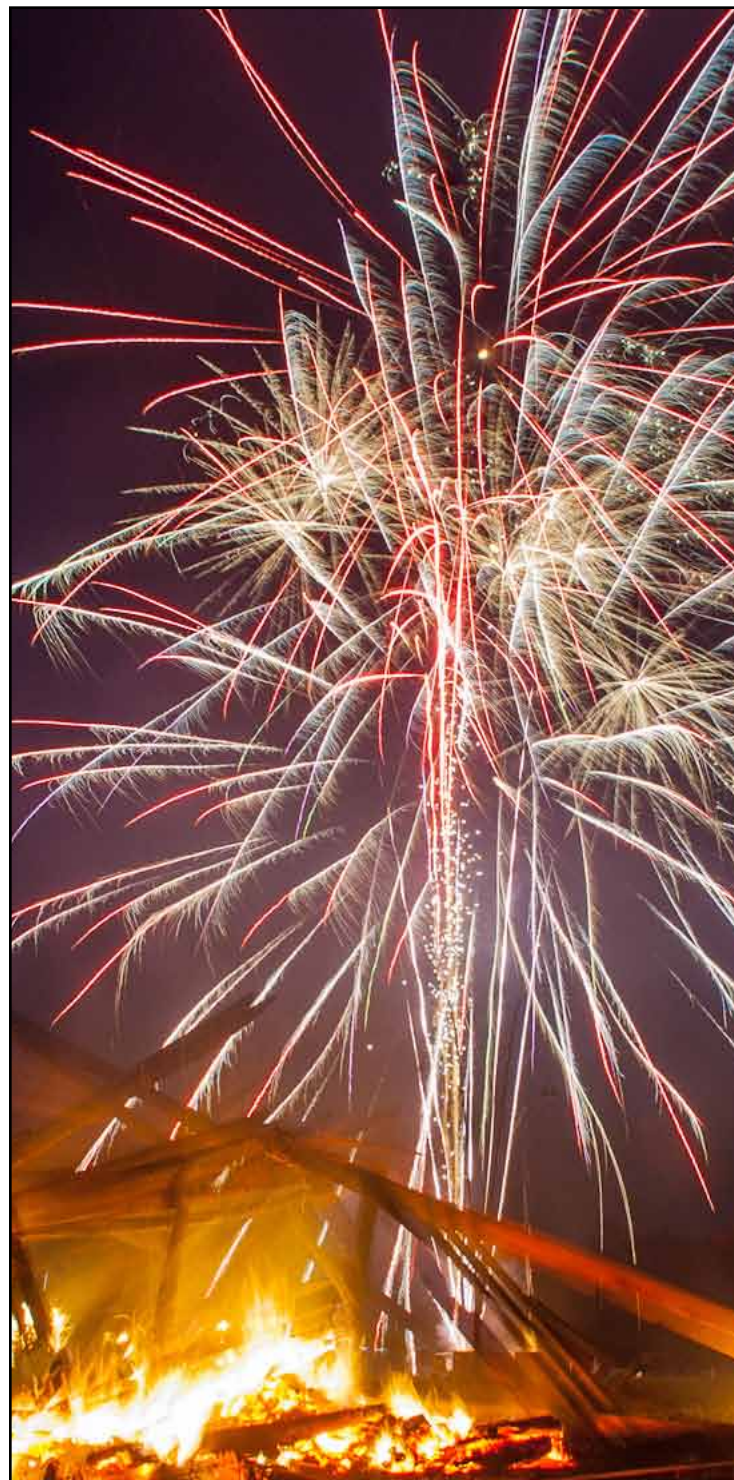
OCF Fourth of July Fireworks