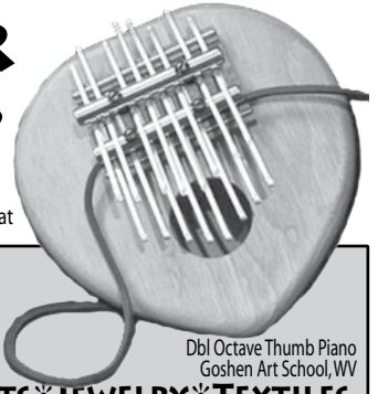
Dbl Octave Thumb Piano Goshen Art School, WV

HOLIDAY HOURS: 10-6 Daily, 10-7 Thurs/Fri/Sat