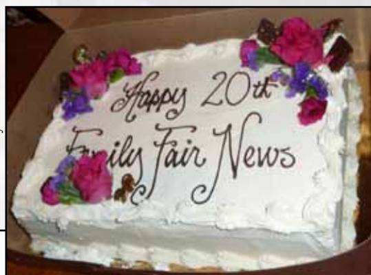
A proofreader's job is never done...