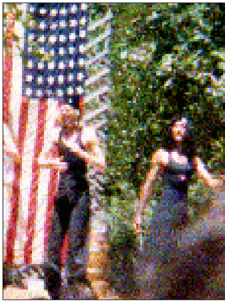
The Flying Karamazov Brothers play music circa 1978.